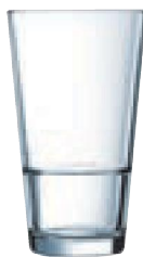
C6 VASOS ALTOS 40 cl Ref: 9205642 Ref: AIF H5642 4/96 M: Ø 83 mm H: 144 mm P: 350 gr 11,87€