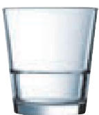
C6 VASOS BAJOS 32 cl Ref: 9205646 Ref: AIF H5646 4/160 M: Ø 92 mm H: 92 mm P: 260 gr 7,87€