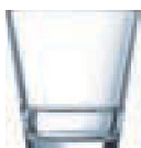
C6 VASOS BAJOS 26 cl Ref: 9210317 Ref: AIF J0317 4/160 M: Ø 85 mm H: 92 mm P: 238 gr 7,57€