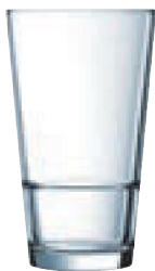
C6 VASOS ALTOS 47 cl Ref: 9205641 Ref: AIF H5641 4/96 M: Ø 87 mm H: 147 mm P: 370 gr 14,91€